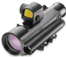
Shown with MRS

The new Intelligent Combat Sight (ICS) integrates a laser range finder and a ballistic calculator into a rugged, compact tactical weapons sight for increased accuracy, greater first-round hit probability, and shorter time of engagement. At the push of a button, an eye-safe laser instantly provides distance to the target and an illuminated, trajectory-compensated aiming point based on ammunition ballistics, measured distance and angle to your target out to 800 meters. As a true electro-optical aiming device, it combines combat-optimized technology, operating simplicity in the field and the targeting effectiveness to give small-caliber weapons oversized clout.