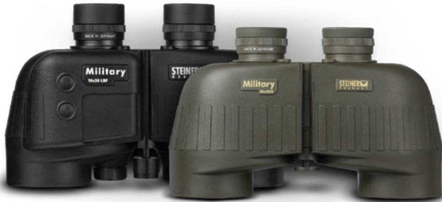
M1050r, M1050r LRF