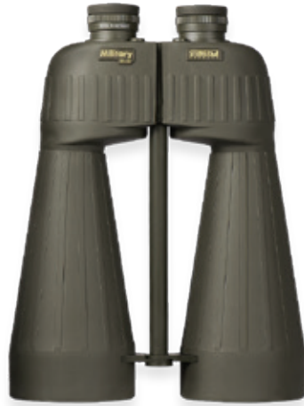
M2080 Military Binocular, shown in green