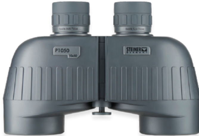
P1050 Law Enforcement 10x50 Binocular