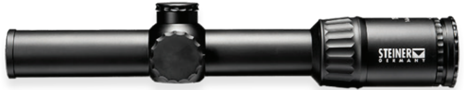
T5Xi 1-5x24 Rifle Scope