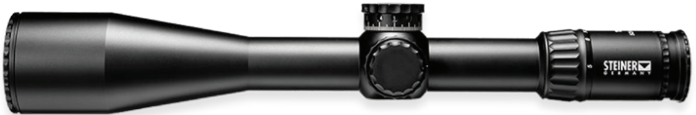
T5Xi 5-25x56 Rifle Scope